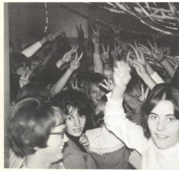
How many girls will fit in the G. R.? In 1970 the answer was 80.

For many women who graduated from Goessel High School the letters G.R. may conjure up memories of a small, narrow, room. A room where only senior girls were allowed, although senior boys often found their way inside.